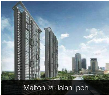
Malton @ Jalan Ipoh