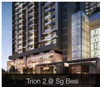
Trion 2 @ Sg Besi