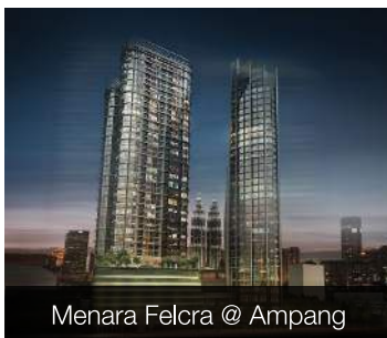
Menara Felcra @ Ampang