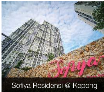
Sofiya Residensi @ Kepong