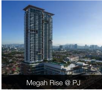
Megah Rise @ PJ