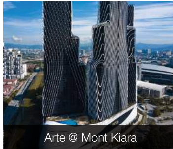
Arte @ Mont Kiara