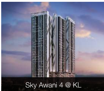
Sky Awani 4 @ KL