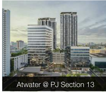
Atwater @ PJ Section 13