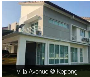
Villa Avenue @ Kepong