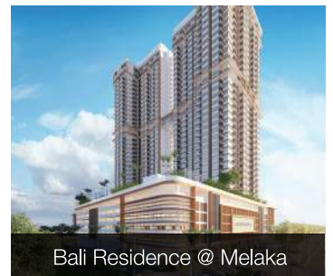
Bali Residence @ Melaka