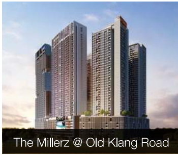
The Millerz @ Old Klang Road