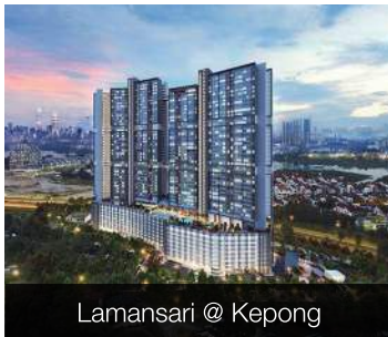
Lamansari @ Kepong