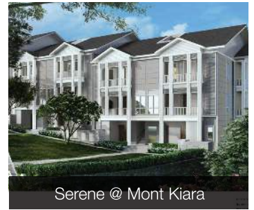
Serene @ Mont Kiara