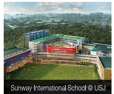
Sunway International School @ USJ