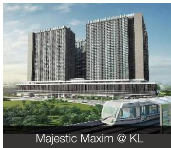
Majestic Maxim @ KL