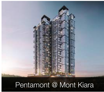
Pentamont @ Mont Kiara