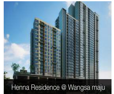
Henna Residence @ Wangsa maju