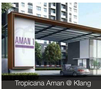
Tropicana Aman @ Klang