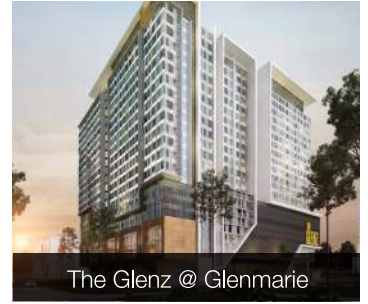
The Glenz @ Glenmarie