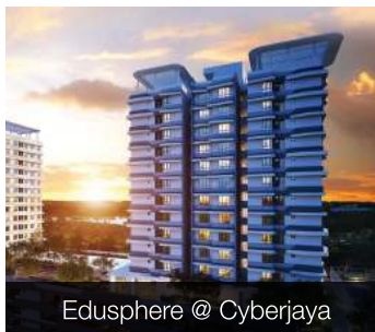
Edusphere @ Cyberjaya